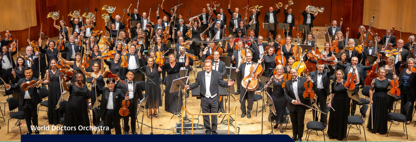
World Doctors Orchestra