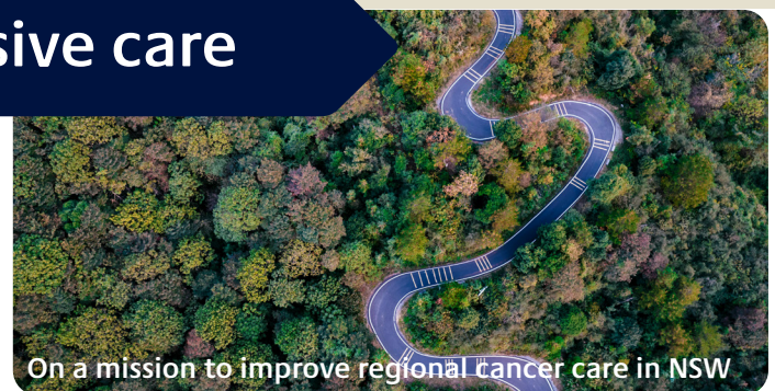
On a mission to improve regional cancer care in NSW

This new hybrid vehicle is more than just a set of wheels. It also enables our rural and regional team to deliver essential education programs to rural GP networks and inform communities about the vital services Chris O'Brien Lifehouse provides. By strengthening referral pathways, we ensure people