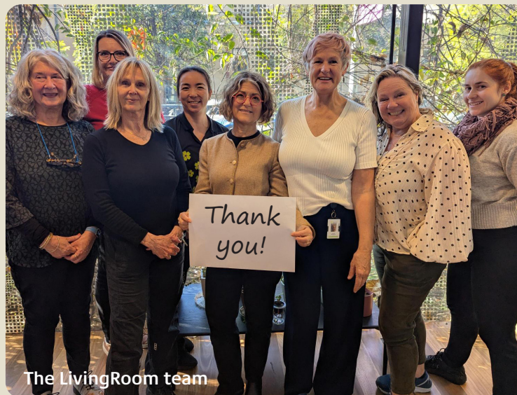
The LivingRoom team

Thanks to your generosity, our recent Tax Appeal has raised $553,000 for the LivingRoom, the home of supportive cancer care and integrative medicine at Chris O'Brien Lifehouse.